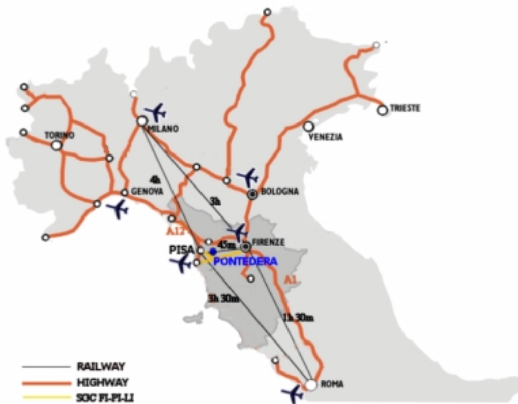
Map 2: Connections to Pontedera from freeway SGC FI-PI-LI